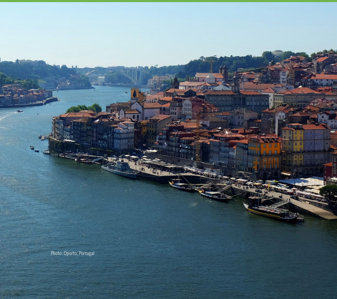
Photo: Oporto, Portugal

The Safer Seas closing cocktail is planned at 19.00. A meeting point is scheduled on the forecourt of The Quartz Conference Centre. Bus shuttles will be organised to the Oceanopolis at Marina of the Moulin-Blanc (20 minutes).