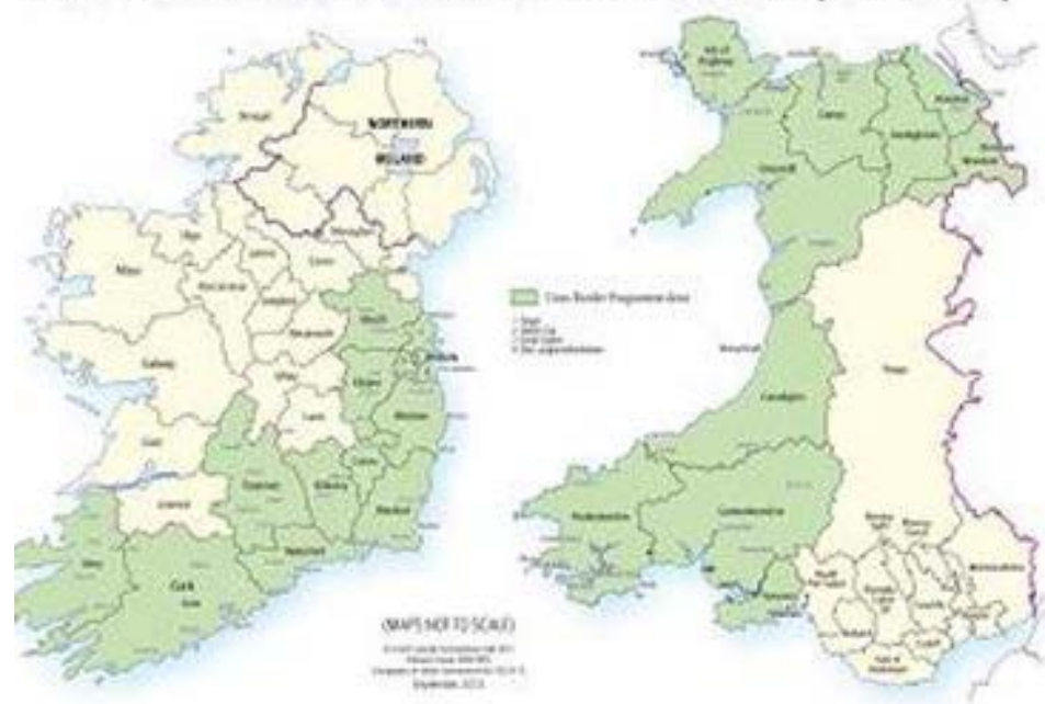
IRELAND/WALES CROSS BORDER PROGRAMME (2014-2020)

*Programme area extended to include these previously adjacent areas